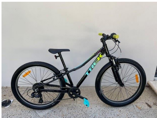
6 - 2020 Trek Precaliber 24"