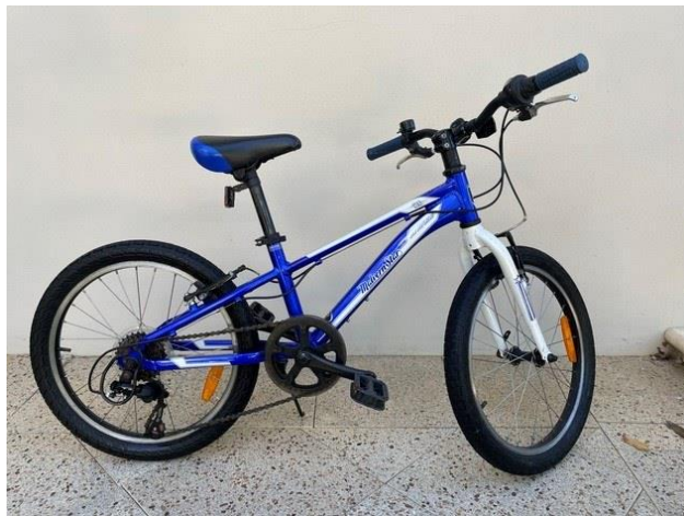
5 - Malvern Star Attitude 20".