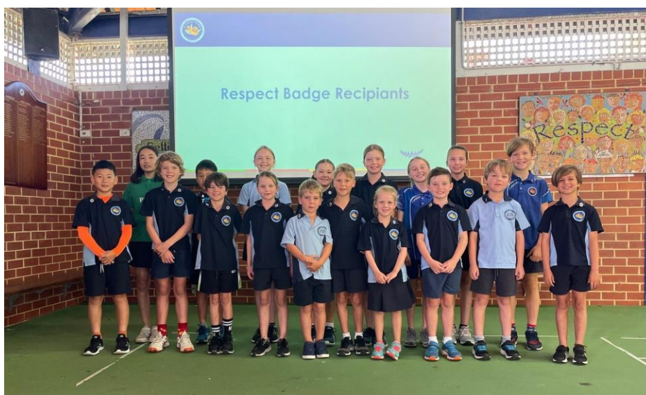
3 - Congratulations on your achievement.