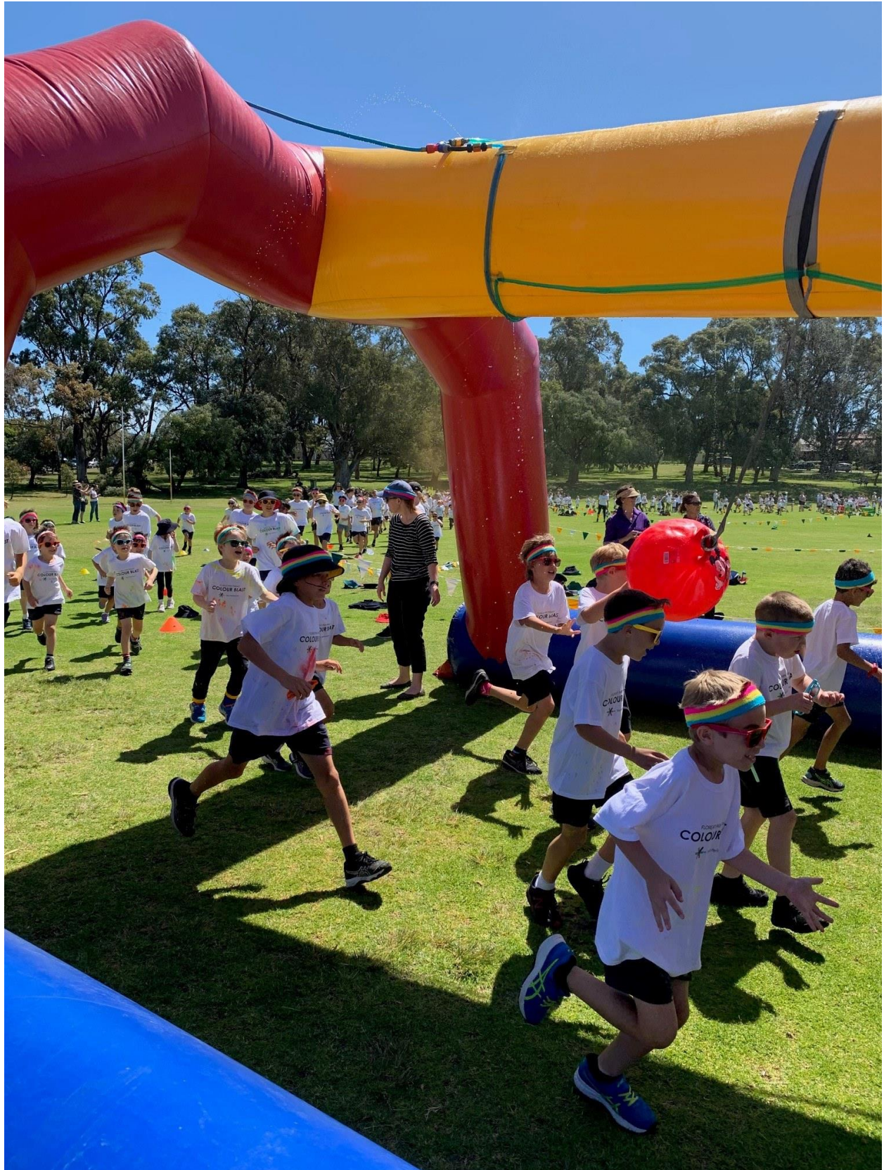
Friday 22 October was full of colour and excitement with our first Colour Blast fundraiser.