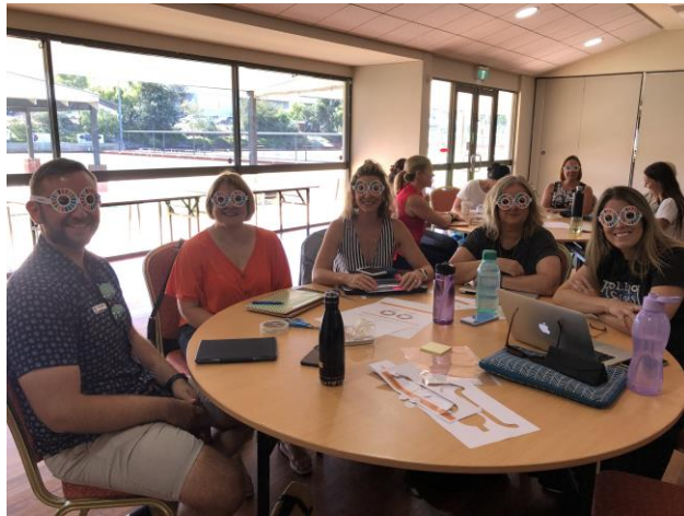
1 - Staff investigating wearing their Global Glasses to find out more about the Global Goals for Sustainable Development (Jan 2021)