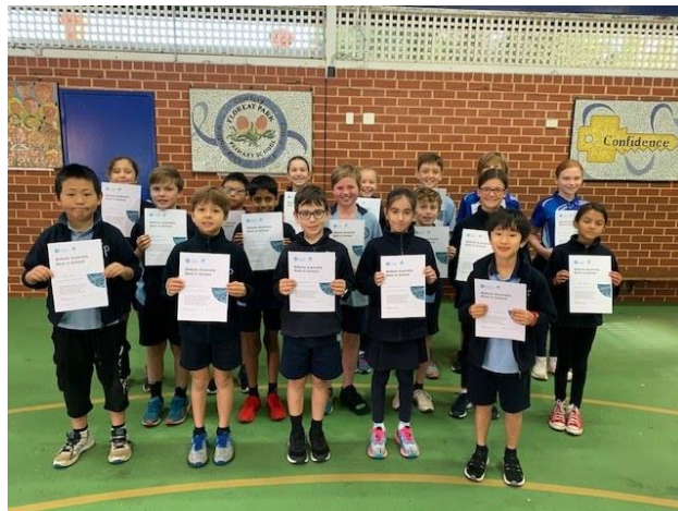
3 - Students in years 6, 5, 4 and Y3G and Y3E will be participated in the Bebras Australia Computational Thinking Challenge 2021 this term as part of the STEM program. It is an activity that promotes computational thinking and problem solving skills. The challenge is an important part of the curriculum and results will be used to assist the school to assess student achievement.

Well done to our Bebras award winners and to everyone who completed the Bebras challenge.