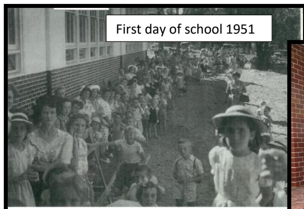
First day of school 1951

Invitees were treated to a school tour and were able to share stories of their early years at Floreat Park Primary with the students.