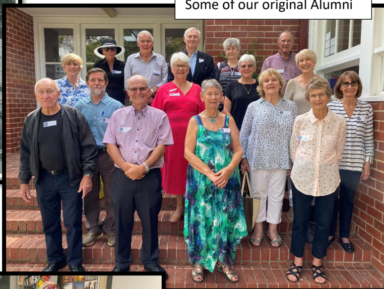
Some of our original Alumni